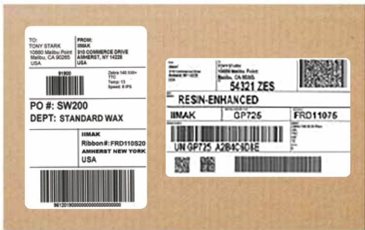
VITW200 Standard Wax